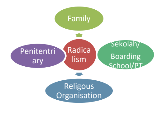
Figure 1 Vurnerable Institutions Experience the Spread of Radical Understanding

Then educational institutions are also considered vulnerable to the occurrence of radical seeding because in this institution, intensive teaching and learning process is carried out. If a teacher has been exposed to or deliberately affiliated to a radical movement, then it is very likely that he will share similar ideas and views with his students. At a minimum it will instill cognitive radicalism . Therefore, in anticipation of this, peace education needs to be developed , both in formal and non-formal educational institutions. (Eka Hendry Ar., 2017; Eka Hendry Ar., 2017)