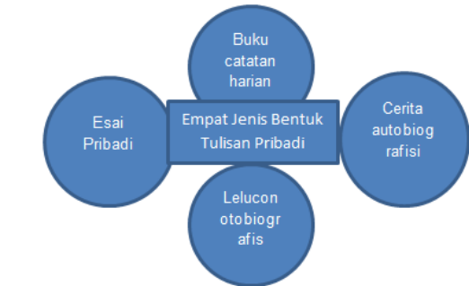
Figure 2: The four types of personal writings (Tarigan: 2008)

Pada penjelasan tentang manfaat menulis disebutkan tentang menulis pengalaman sebagai sarana terapi katarsis. Menghilangkan rasa ketegangan dari energi emosi positif maupun negatif. Tulisan Pribadi adalah satu di antara media yang dapat digunakan dan diterapkan membiasakan menulis. Tarigan menjelaskan bahwa buku harian termasuk bentuk tulisan pribadi. Bentuk tulisan pribadi lainya sebagaimana gambar berikut: