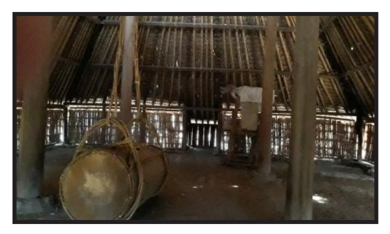
The nuance inside the Ancient Bayan Mosque: a ground floor, a hanging Bedug, a simple pulpit, and a place for a prayer leader (imam).

There are special rules regarding who may or may not enter the ancient mosque, including what kind of clothes that they have to wear. The clothes worn by the Muslim clerics and the priests of the Bayan Ancient Mosque also have meanings, such as a white color refers to holiness and a red long cloth ( dodot ) to leadership; the dress is equipped sapuq or bongot (headband) (Matindas, 2018). In addition, the rules also said that anyone who enters the area of the ancient mosque should dress in a way that accords the custom.