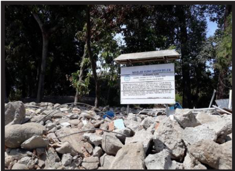
The current condition of the Bayan Ancient Mosque, standing in grandeur despite the devastating earthquake that hit Lombok several times