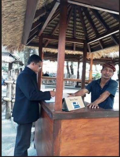
The Entrance of the Sade Traditional Village and the Retribution Post (Personal Document)

After filling out the guest book and "paying" the retribution fee, I was asked to follow my guide to Balai Tani, which is located at the left side of the retribution post. After sitting down, the guide stood in front of visitors and