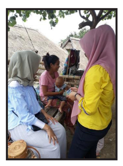
A 14 years-old Sasak Sade woman with her child. (personal document)

Secondly, woman in Sade village are married in an earlier age and they usually "must" have minimum four children. One of my informants was a 14 years-old married woman. When the interview was conducted, the woman is breastfeeding her child. In Sade, there is no minimum age for women to marry. A women with a weaving skill is considered eligible to involve in merarik tradition. This phenomenon is not only happening in Sade, but also in Bayan and Ende. As a result, many teenagers had to become widows while having dependents of one, two and three children. In addition, there is a convention in Sade that women should have four children who will in the future hold the four coffin corners of their died parents. The problem is not just about the number of children that a woman should have, but also the fact that a young woman, who is still a teenager and uneducated, has to take care of children in a poor economic condition. Consequently, many marriages ended up with divorce. It is common to see a young and poor divorced woman with many children in Sade. Finally, ignorance and poverty in a systematic and a structured way have been inherited on behalf of local wisdom.