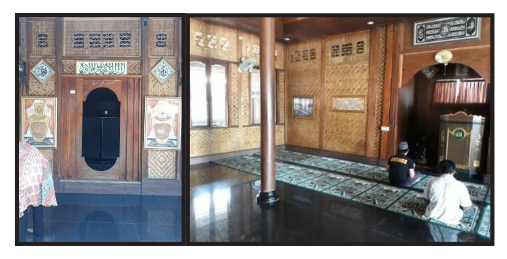
The 'luxurious' entrance and room of the mosque (Photograph of Personal Documents)

rice husk and buffalo dung, and is regularly mopped when the ground floor has begun to break or is no longer smooth. They also fluently explained that no building is allowed in the Sade area. However, the truth showed that some houses already have cement floors, their own bathrooms, and water reservoirs. In fact, in the corner of Sade village there is a mosque that is quite luxurious, black ceramic floored, and equipped with a seemingly modern bathroom and a wudu place.